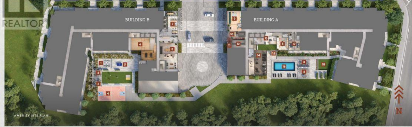
AMENITY SITE PLAN