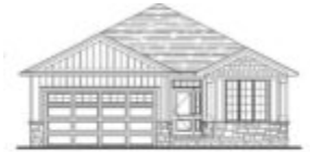
THE HARPER - 45 1300 SQ FT